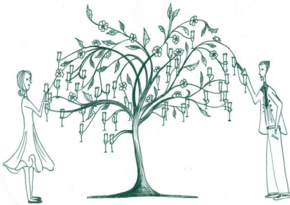
The Enchanting Tree, Tord Boontje, 2013