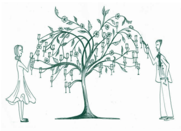
The Enchanting Tree, Tord Boontje, 2013